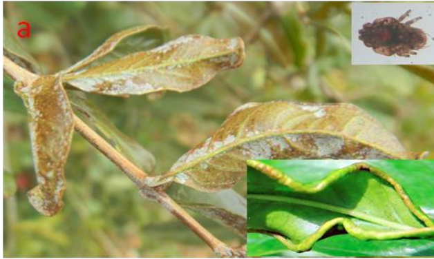
a. Mites on leaves