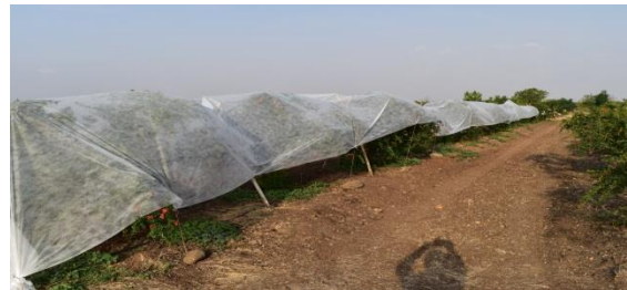
Protective crop cover